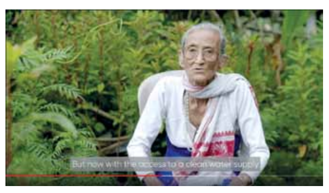
(a screenshot from a BBC Storyworks Production on the University's Safe Drinking Water)

The links to all these films, including the one on our University's efforts in the area of affordable clean drinking water in the villages around our campus, are provided at the IAU website: https://www.iau-aiminghigher.org/index.html#all-films.