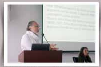
Certificate Course on Neuropsychology and Its Applications