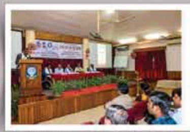
UCC Workshop on Evaluation Reforms In Higher Education Institutions